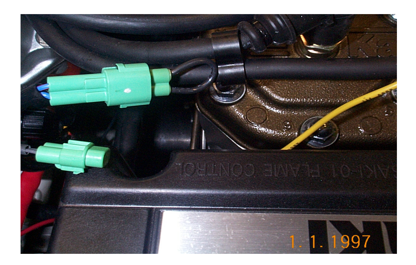
Figure 3 (2004 Models only)